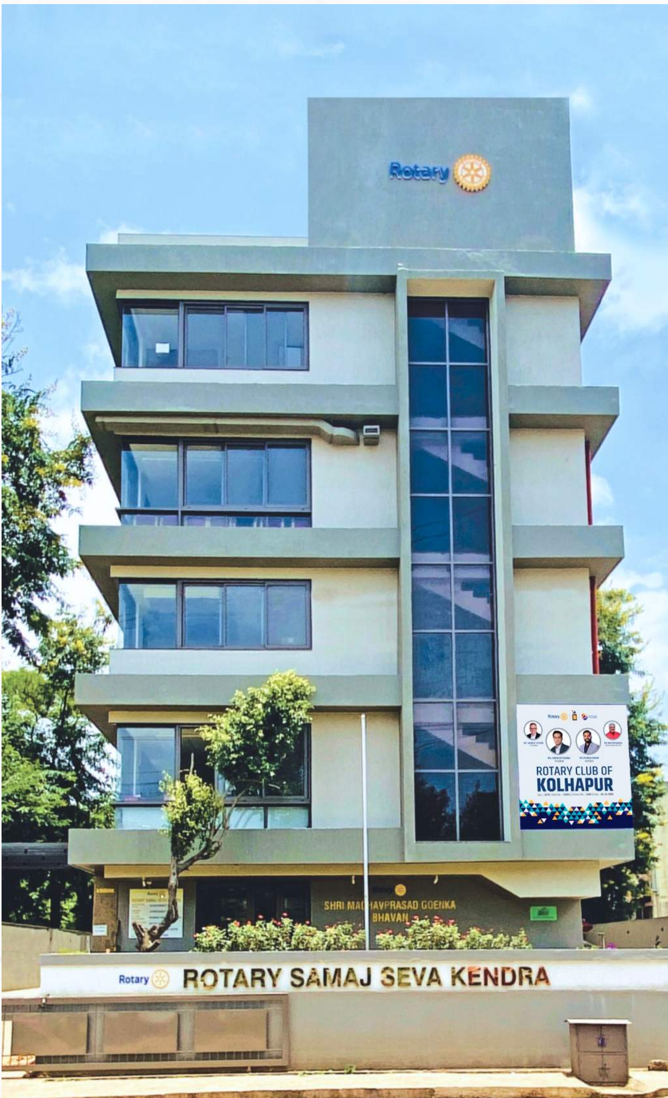
ROTARY CLUB OF KOLHAPUR'S ROTARY SAMAJ SEVA KENDRA BUILDING